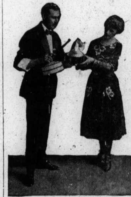
THE MARCO COMPANY